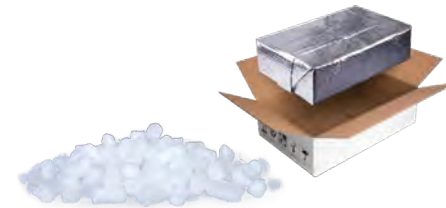
Dry ice & coolbox liner